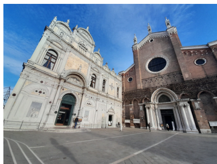
SS. Giovanni e Paolo Hospital Castello 6777, Venice