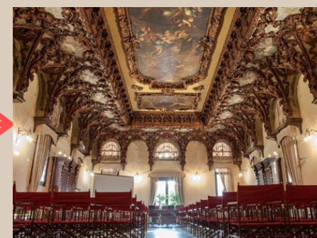
San Domenico Room