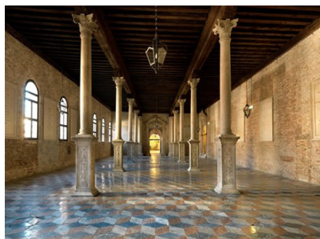
Entrance from Campo Ss. Giovanni e Paolo