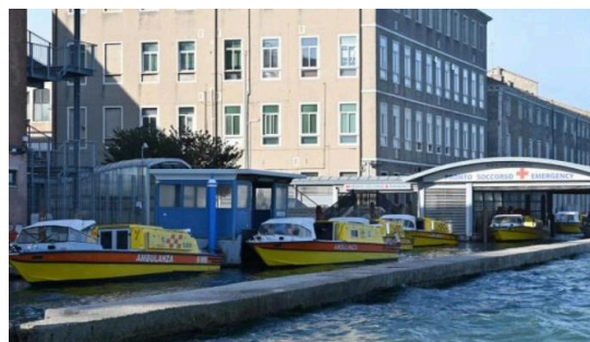
Entrance from Fondamente Nove Jona Reception